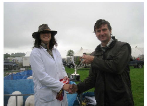
A wet day at Tivyside Show

Full results of all shows will be published in the 2010 flock book.