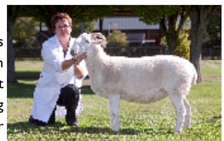
Champion Female selling to 370gns