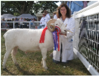
New Forest Show

New Wiltshire Horn classes were arranged at Stithians show in Cornwall and the North Devon Show. Only the North Devon show was able to go ahead and, as it is unlikely that we could guarantee enough interest in Stithians show next year, we will not be asking for classes again. We expect to hold classes again at North Devon but this will only be possible if members from the South West are willing to support the show classes by entering in 2011.