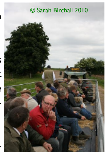
Off on the Farm Tour

A successful day finished with many visitors saying how enjoyable and informative they found the visit. Many visitors were new to the breed and three new members joined on the day.